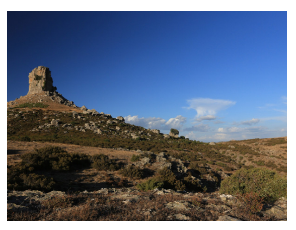
Page 3 of 5 - Copyright EUROPE ACTIVE - 27 April 2024

gr20.co.uk Strada Vecchia n°7 20290 BORGO - FRANCE